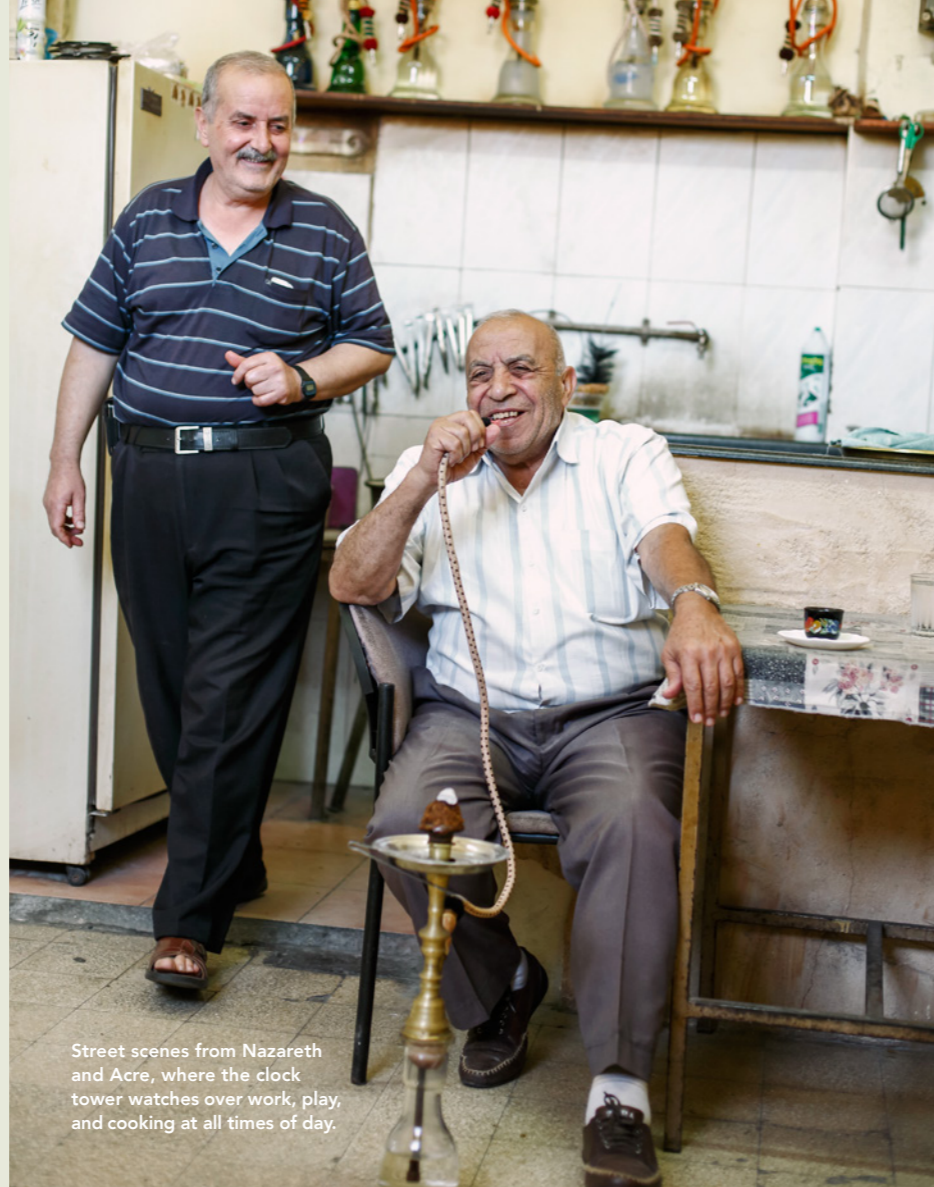
Street scenes from Nazareth and Acre, where the clock tower watches over work, play, and cooking at all times of day.