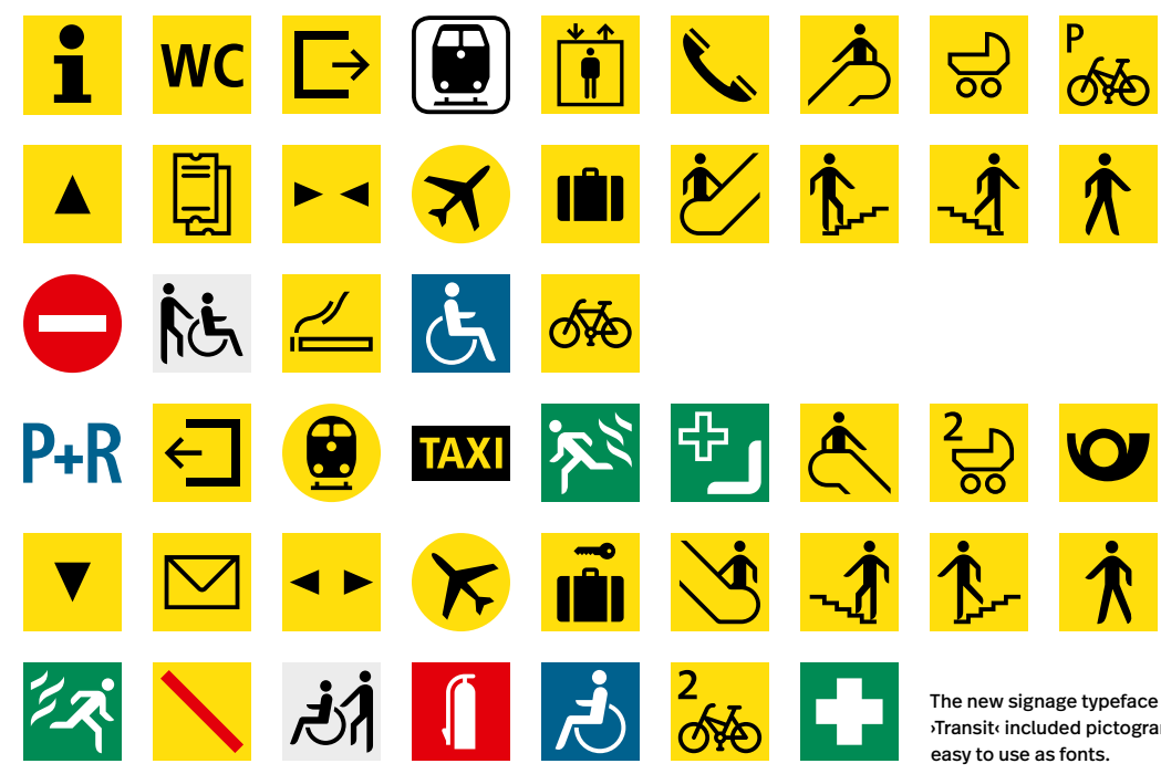
The new signage typeface 'Transit' included pictograms, easy to use as fonts.