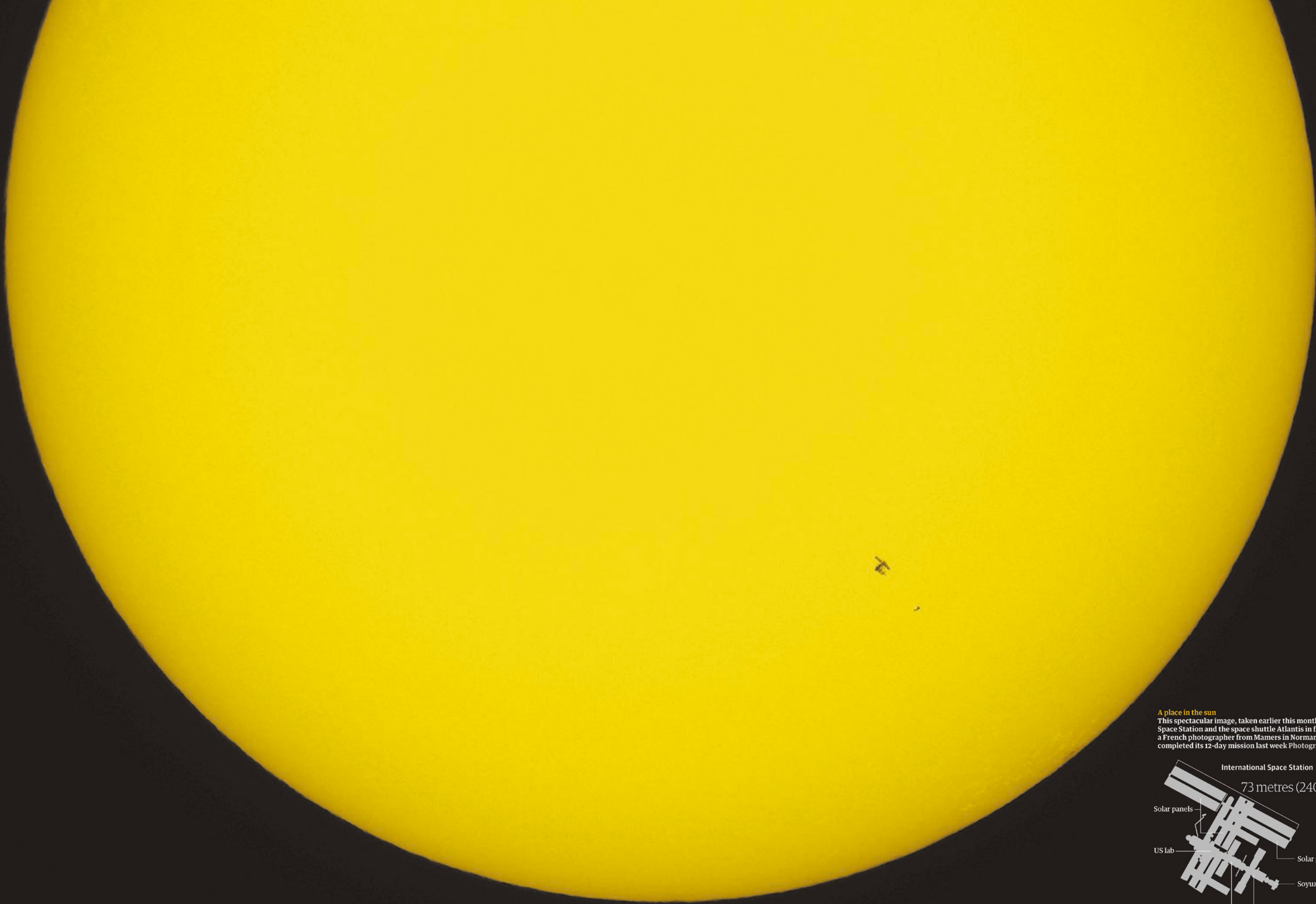
A place in the sun This spectacular image, taken earlier this month, shows the International Space Station and the space shuttle Atlantis in front of the sun. It was taken by a French photographer from Marnes in Normandy. Atlantis and its crew completed its 12-day mission last week

right corner. What better way to indicate the different sizes of the three elements? This visualization is a magnificent example of the reach of infographics and serves as proof that a discipline should never be limited to clichés or standard devices.