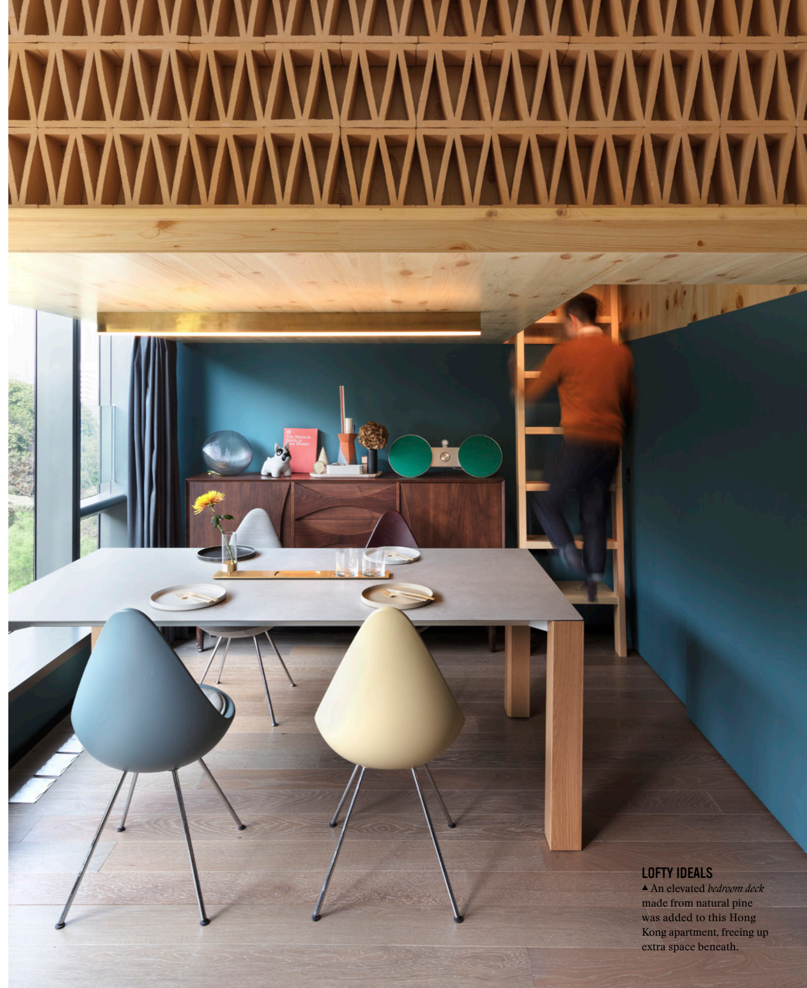
LOFTY IDEALS ▲ An elevated bedroom deck made from natural pine was added to this Hong Kong apartment, freeing up extra space beneath.