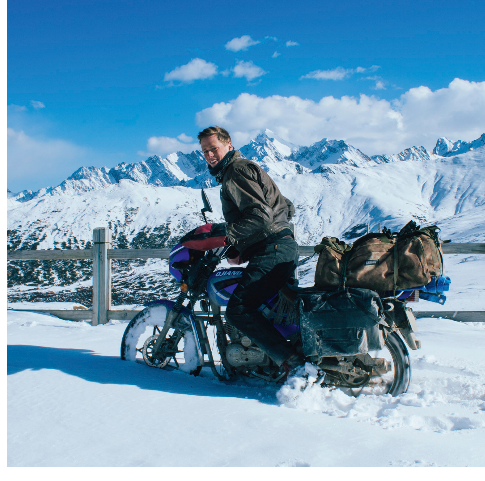
The friends were to find that trips like these are not only possible, but infinitely better on a shoestring.

snowy Ala-Too Range, part of the enormous Tian Shan mountains, also known as the Tengri Tagh, separating Kyrgyzstan and Kazakhstan from northern China.