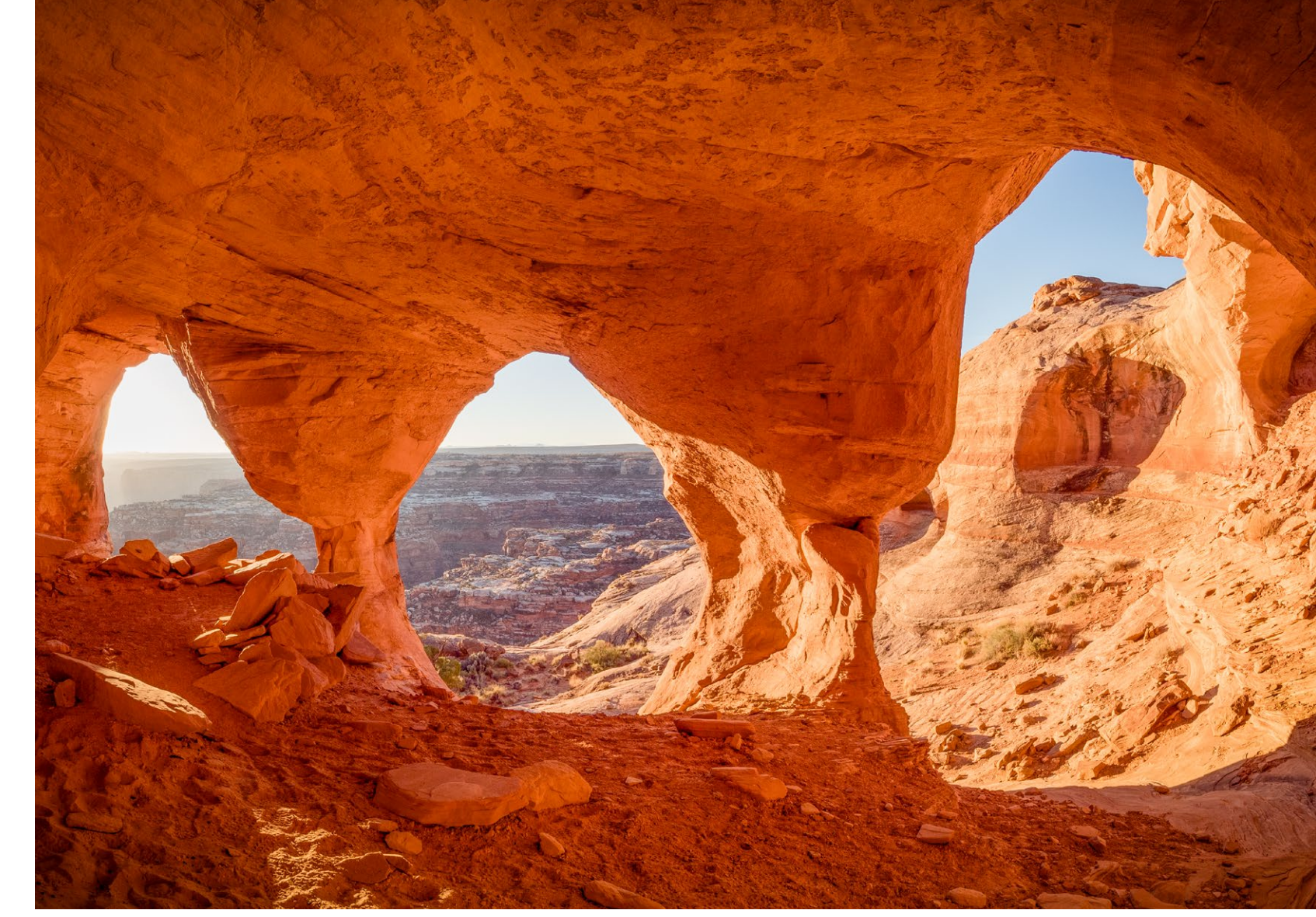
Above: Looking through one of nature's incredible arches out onto Canyonlands near the Green River. Left: Narrow cut in the Halls Creek Narrows, Capitol Reef National Park.