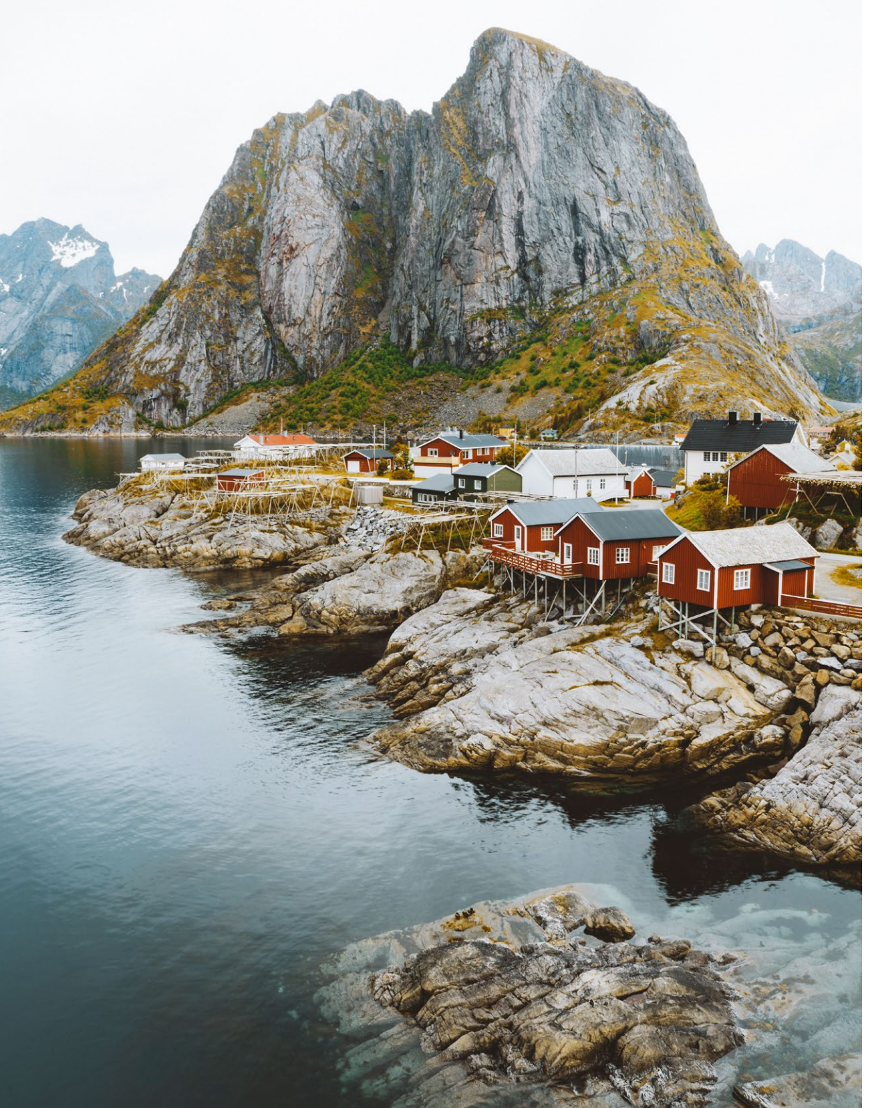
Side trip to Hamnøy, one of Lofoten's most picturesque fishing villages.

final push to the summit, in which hikers can expect to negotiate loose rock and boulders. Upon reaching the top, you will be greeted with one of the most stunning views imaginable. In every direction, there are glacier-sculpted fjords, granite pinnacles, sheer cliffs, and hidden coves and islets. In fine weather, it is a panorama you will never forget.