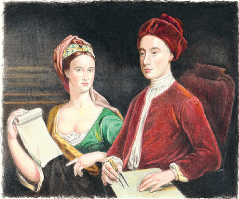
ABOVE The Earl of Burlington and his wife Dorothy Savile. OPPOSITE Burlington House in the former gardens of which Savile Row was built.

THE ART of hand tailoring in London can be traced back more than 700 years to the 13th century, when a radically new style of creating garments was developed in Europe, taking its name from the French tailleur , meaning 'to cut'.