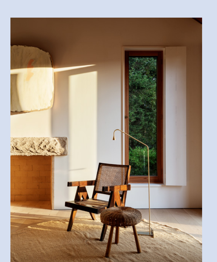
TOP LEFT Darker wood is softened with sheepskins and white-painted floorboards, as seen in Purveyor Design's East Hampton beach house. BOTTOM LEFT A cane headboard, paired with a woven lampshade. TOP RIGHT With the ocean at your cabin door, a boat is all you need. BOTTOM RIGHT Furniture as sculpture. Leave space for special pieces to shine.