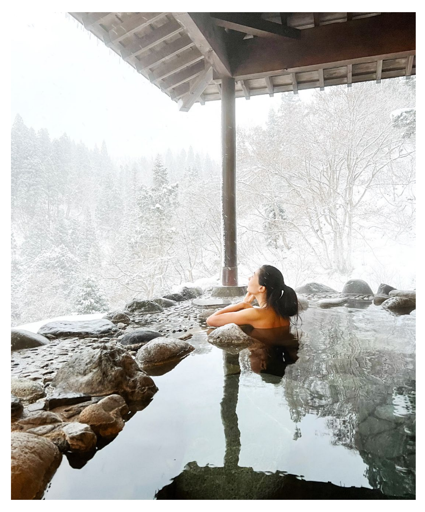
In winter, thick layers of snow cover the surrounding countryside, but the area's hot springs maintain a temperature of around 131 degrees Fahrenheit (55 degrees Celsius), offering visitors an incredible sensory experience.