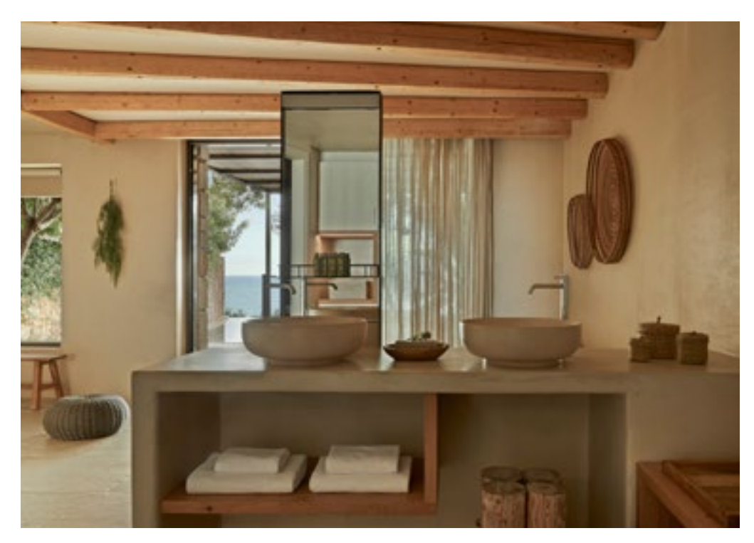
ABOVE Built to reflect the characteristics of the local architectural style, guest accommodation is predominantly made of stone and finished with natural materials. All rooms have sea and garden views and feel deeply immersed in the surrounding landscape.