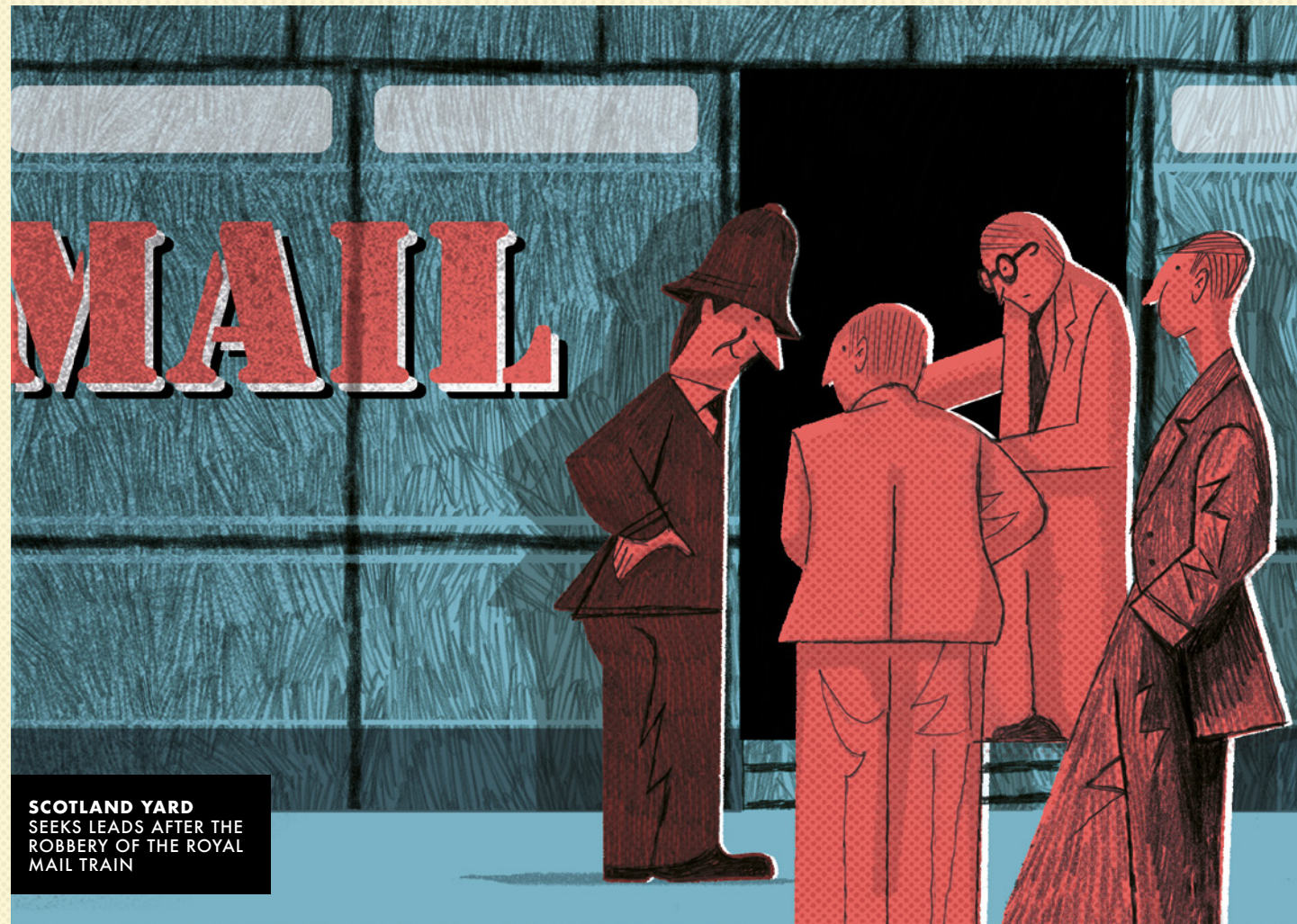
SCOTLAND YARD SEEKS LEADS AFTER THE ROBBERY OF THE ROYAL MAIL TRAIN

THE BOOTY, WORTH £2.6 MILLION, MAKES THIS A LEGENDARY ROBBERY