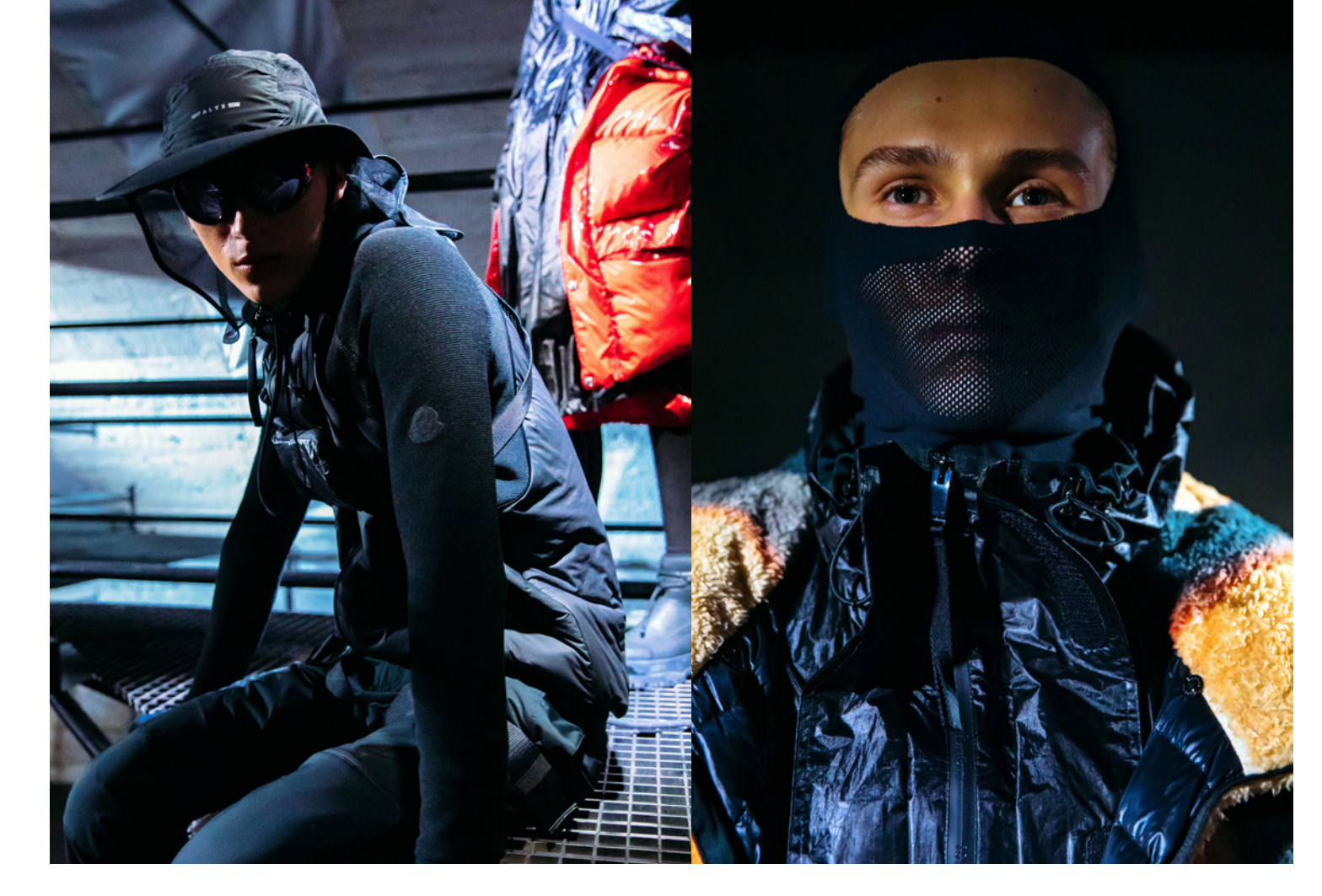
MONCLER GENIUS DISRUPTED LUXURY OUTERWEAR BY BLURRING LINES BETWEEN HIGH FASHION, STREETWEAR,