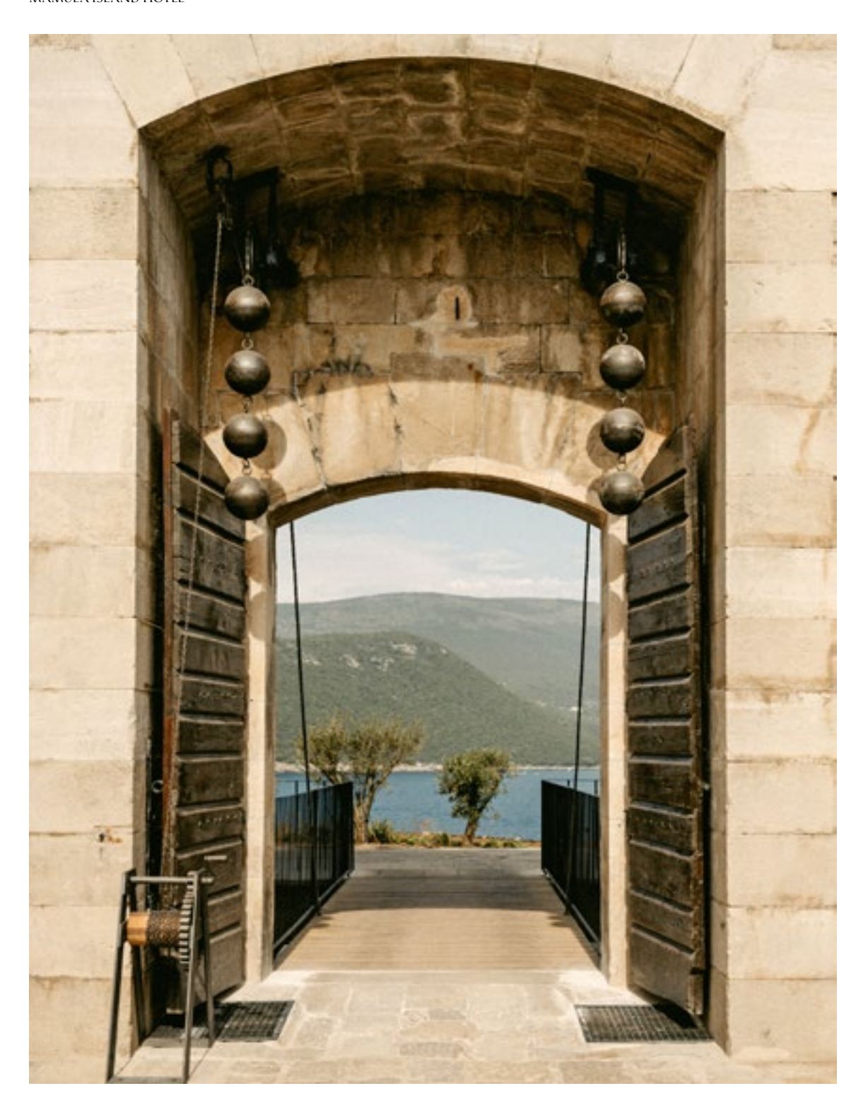
ABOVE On arrival to the island by speedboat, guests find themselves in front of an imposing arched gateway with a wooden drawbridge. Across the bridge is a large, welcoming, stone-paved courtyard with views to the sea. Opposite Simple, comfortable indoor and outdoor spaces for yoga and relaxation.