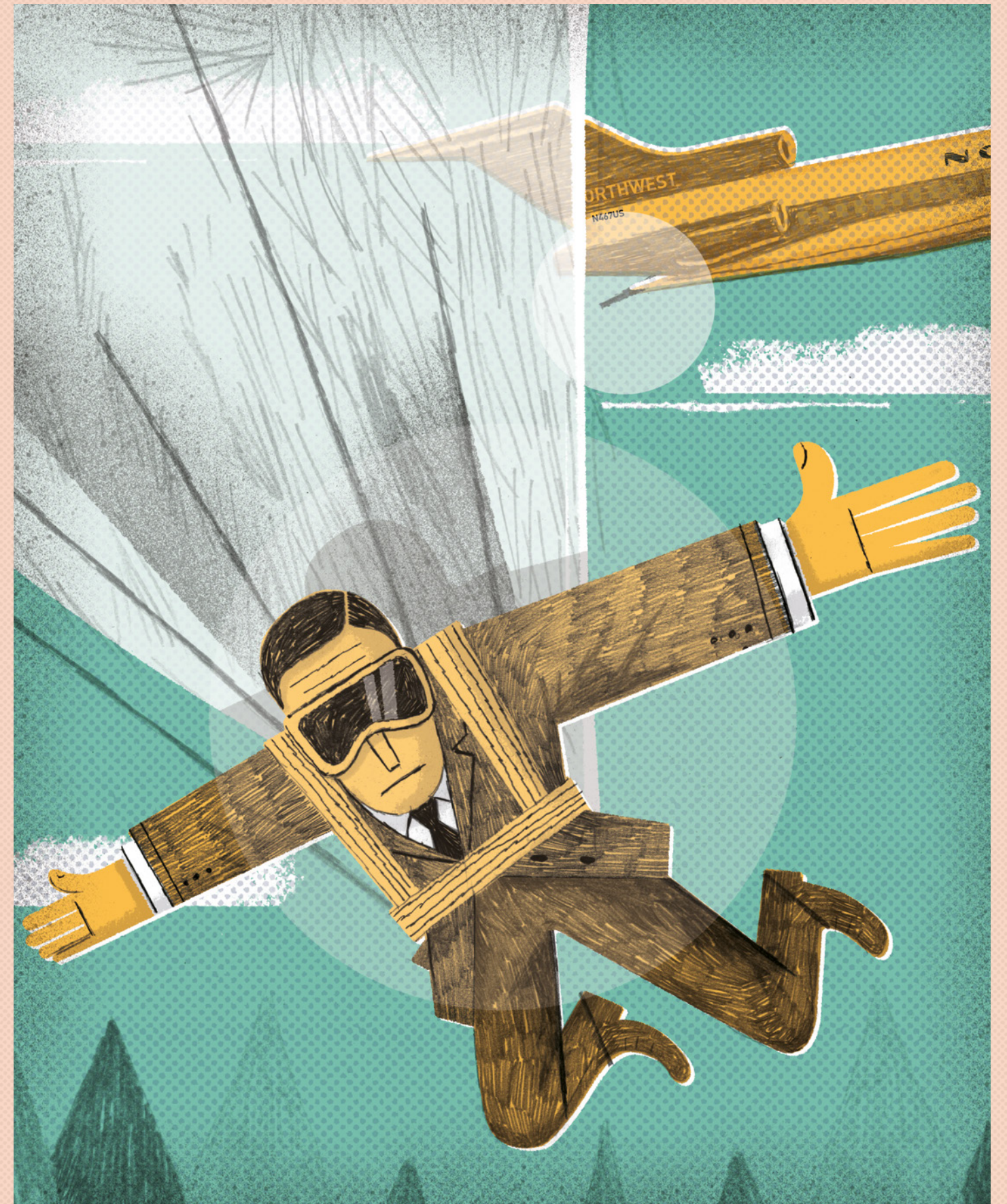
COOPER JUMPED OUT OF THE PLANE VIA THE REAR DOOR. BELOW HIM WERE THE HUGE MOUNTAINS AND FORESTS OF WASHINGTON STATE.