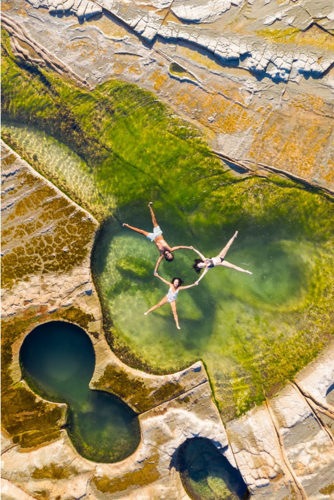
Figure Eight Pools · Sydney, Australia