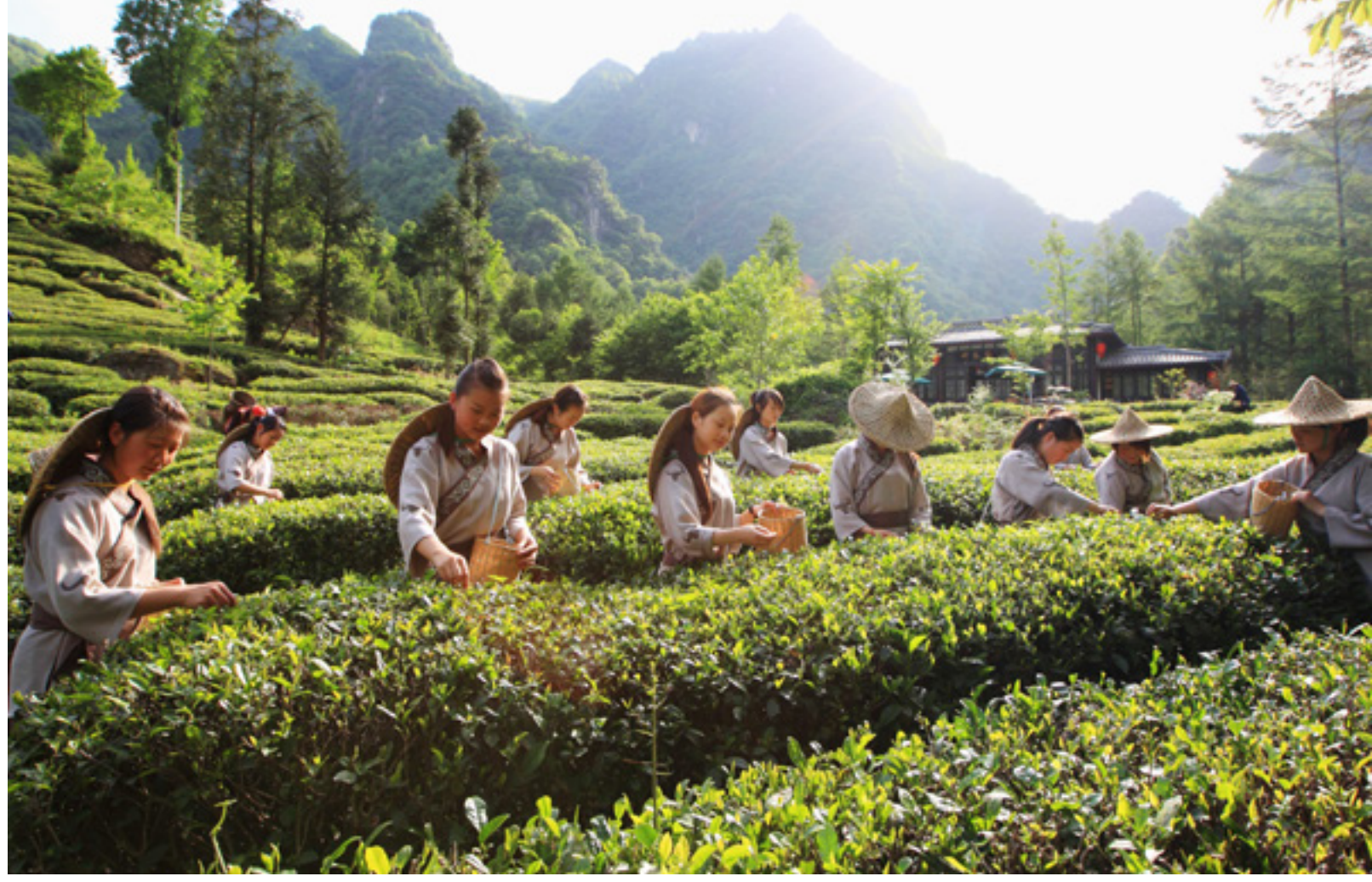
(ABOVE) TEA PICKING. HUBEI IS ONE OF THE NATION'S MAJOR TEA PRODUCING AREAS. (BELOW) THE GOLDEN SNUB-NOSED MONKEY.