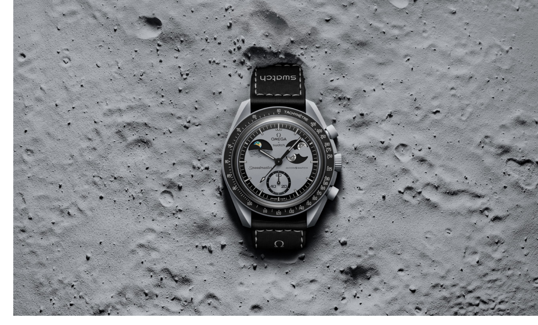
A COLLABORATION THAT FUSED OMEGA'S ICONIC MOONWATCH WITH SWATCH'S COLORFUL, ACCESSIBLE DESIGNS.

The MoonSwatch collaboration was a smash hit, selling out almost immediately and creating buzz worldwide for blending high-end heritage with playful, accessible design. It brought together two of the most iconic names in the watch industry and made space exploration a little bit closer.