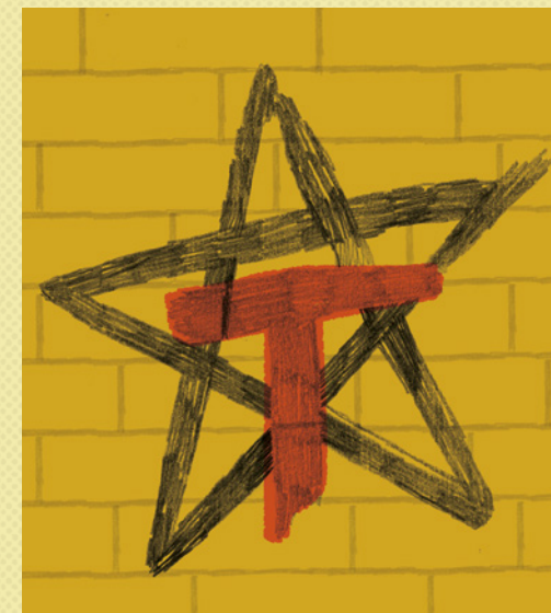
THE TUPAMAROS'S SYMBOL, A STAR, INSPIRED THE NAME OF THE ESCAPE PLAN: OPERATION STAR.

Communication with the prisoners group members was by a clever numerical code. During visits, family members would pass coded messages on rolled-up cigarette paper to the inmates. They called these "pills" and hid them in their mouths. The prisoners decoded the messages to prepare for their escape. They also received miniature pencil-drawn plans.