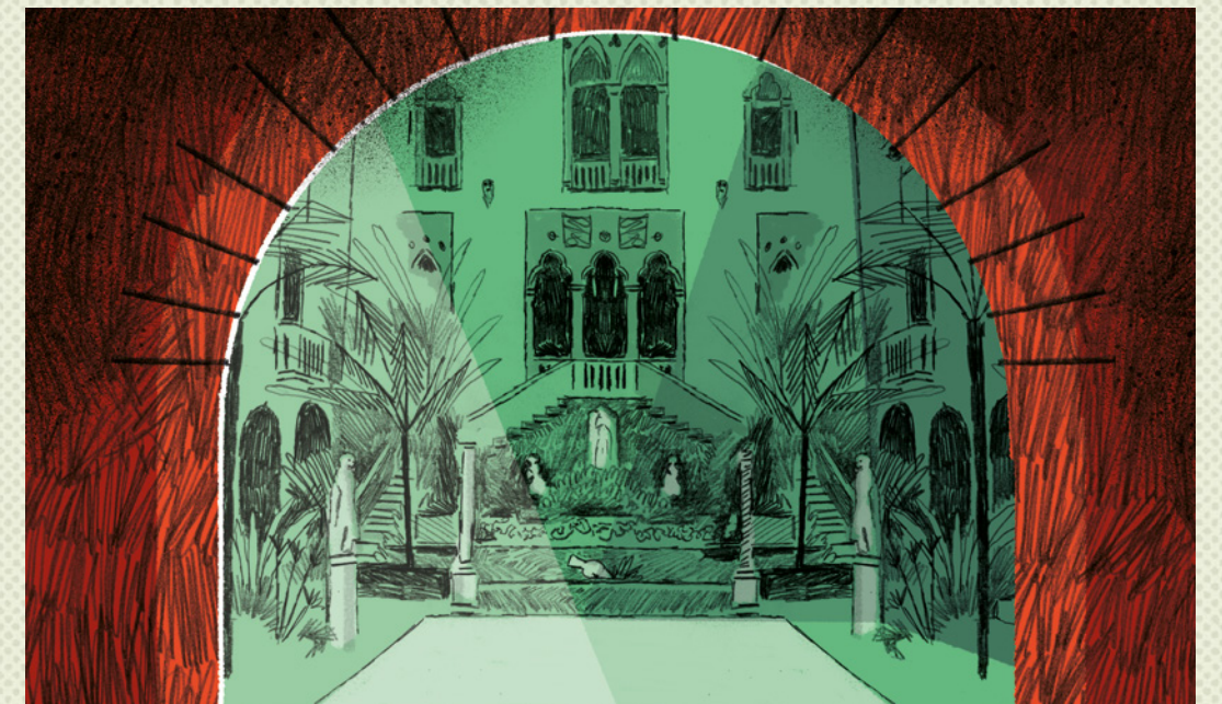
BOSTON'S ISABELLA STEWART GARDNER MUSEUM. ITS DESIGN WAS INSPIRED BY RENAISSANCE PALACES.

The few traces left behind by the thieves were not clear enough for investigators to obtain details on how the robbery had been planned. In any case, the police declared that it had been plotted several months in advance. The burglars knew everything about the museum and its state-of-the-art security systems.