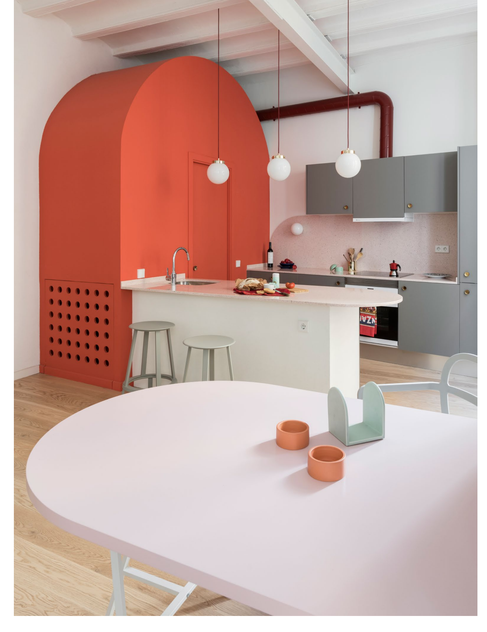
→ The curvaceous kitchen that Colombo and Serboli Architecture designed for this centuries-old building features a coral-colored volume that cleverly conceals a separate cloakroom. Brass accents have been implemented throughout, and surfaces are clad in pink terrazzo-like quartz.